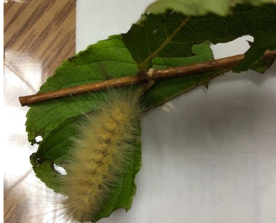
Yellow bear caterpillar.