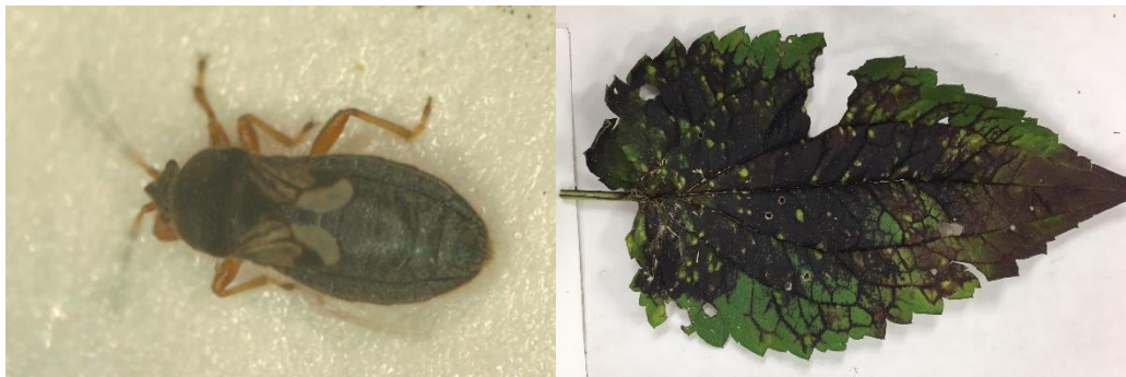
Chinch bug (left) and leaf damage caused by rudbeckia psyllid (right,).