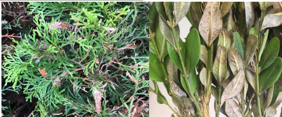
Bag worms on arbovitae (left,); and Volutella blight on boxwood (right,).