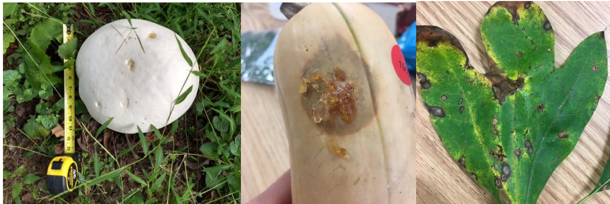
Giant puffball ( Calvatia gigantea) found in a yard (left,); Gummy stem blight lesion ( Didymella bryoniae) with gummosis on butternut squash (center,); and sassafras anthracnose ( Colletotrichum sp.) on sassafras (right,).